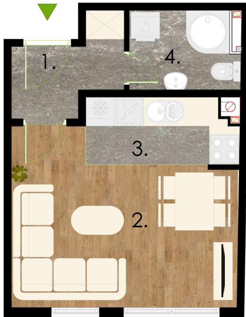
STAN BROJ 2 P = 26,52 m2