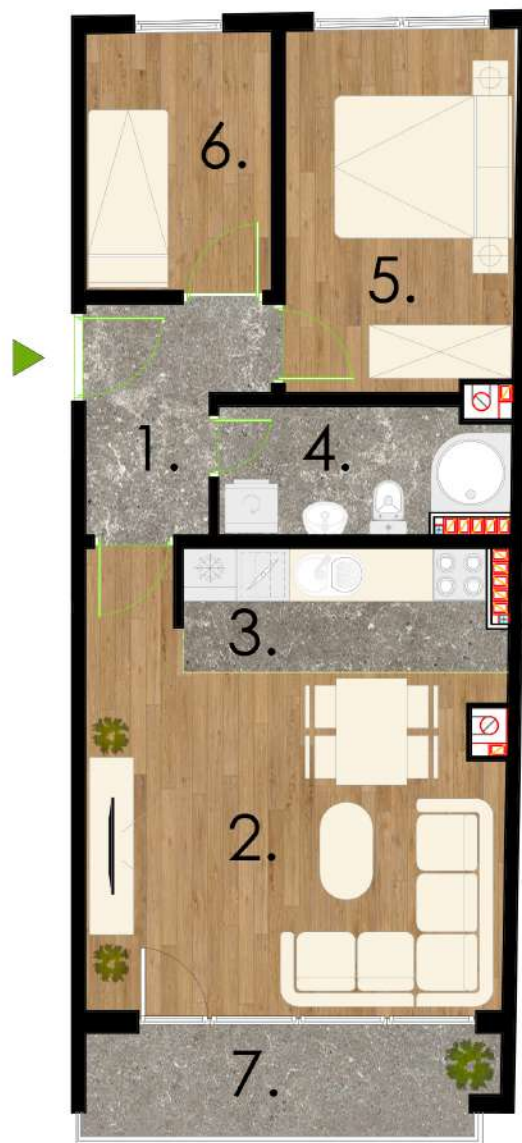
STAN BROJ 11 P = 52,88 m 2